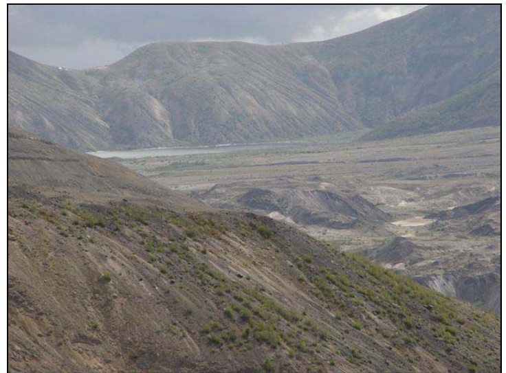
Inside the mountain (see story on page 2)